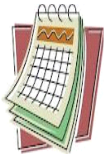
Calendars that hang on the wall of your house tell you what the seventh day is.

From the beginning, God sanctified a day to rest. It was provided not only for man to rest, but to worship Him. "...And on the seventh day God ended his work which he had made; and he rested on the seventh day ...And God blessed the seventh day and sanctified it." ( Gen 2: 2-3 ). The Lord Himself delivered the commandments upon Mount Sinai to the children of Israel as the